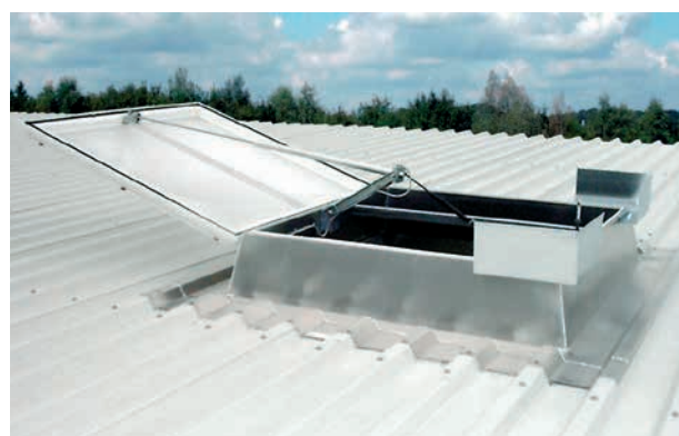
Steel aluminium integrated TRP RAK upstand 30 cm high with SHEV dome rooflight