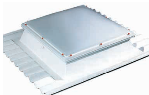
GRP AK for corrugated profile 30 cm high with TOP-90 dome rooflight